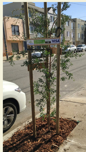
New tree with fresh mulch, Outer Sunset neighborhood

WEED: Weeds will grow with the winter rains. Remove any weeds in your garden and tree basin now so they won't compete with the plants and trees you want to keep.