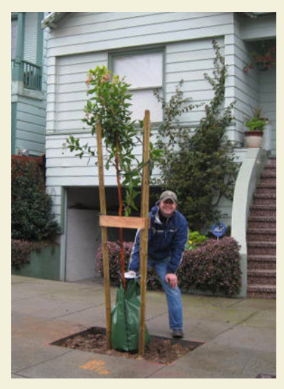
Water even during the rainy season

During the rainy season, each inch of rain is equivalent to about 5 gallons of water, so adjust your watering accordingly. If a tree gets too much water its leaves droop, turn brown or yellow, dry out, and drop.