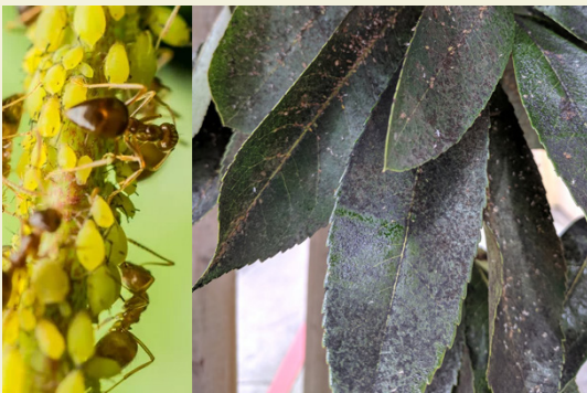
Ants, aphids, and sooty mold

You can also introduce some predators—just buy ladybugs or lacewings at a gardening store (release them at night so they don't fly away before noticing the tasty aphids).