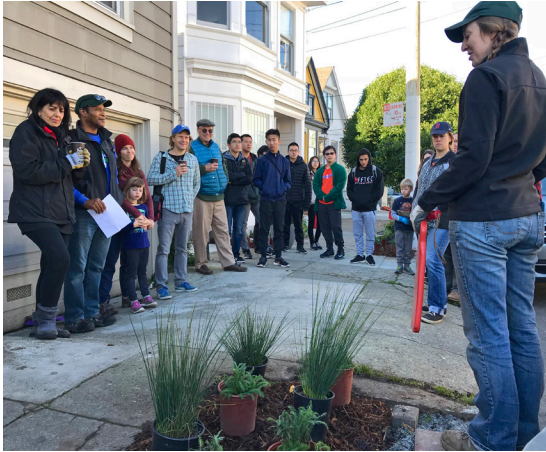
From January 25 to 27, Friends of the Urban Forest led volunteers and neighborhood residents in installing new sidewalk gardens in the Bernal Heights neighborhood.