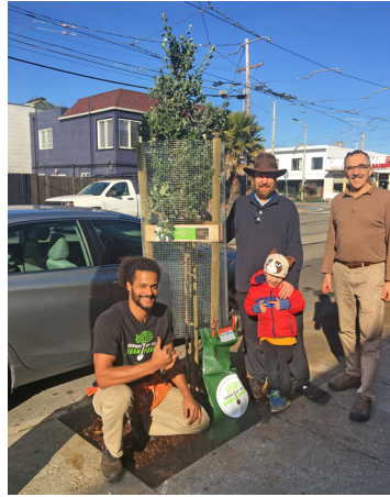
At the invitation of Congregation B'nai Emunah , we planted trees on January 31 in the Outer Sunset in celebration of the Tu B'Shevat holiday.