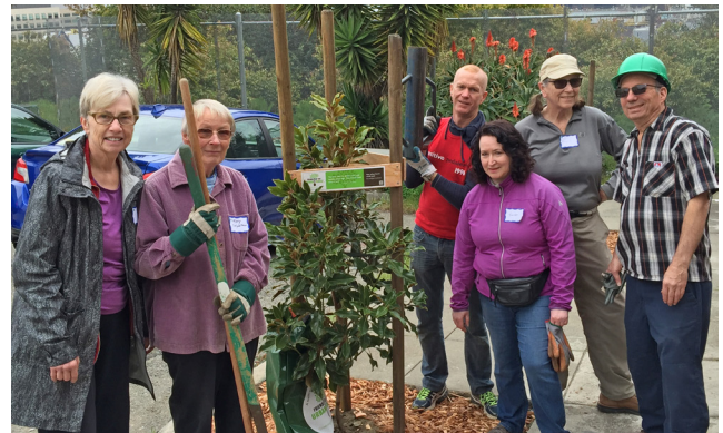
On March 10, a group from the First Unitarian Universalist Society of SF planted trees with us in Potrero Hill .