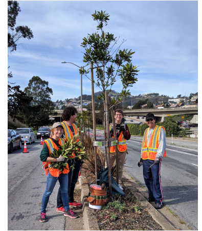
On February 10, our tree care staff joined SF Public Works' Clean Team to prune trees in the Excelsior .