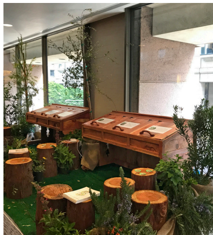
In partnership with other forestry organizations and agencies, we produced a " Tactile Educational Forest Parklet " for the annual New Partners for Smart Growth Conference , February 1-3.